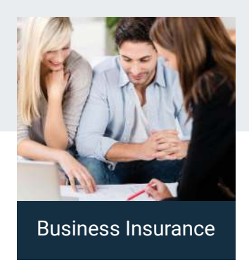
• 4 Beaconsfield Road, St. Albans, AL1 3RD